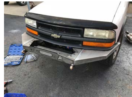
STEP 4 - INSTALL BUMPER END SECTIONS WITH HARDWARE SHOWN ON SHEET 1 AND ADJUST ENDS AND CENTER BEFORE TIGHTENING.