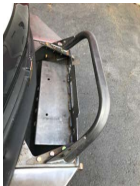
STEP 5 - INSTALL BULL BAR WITH HARDWARE SHOWN ON SHEET 1.