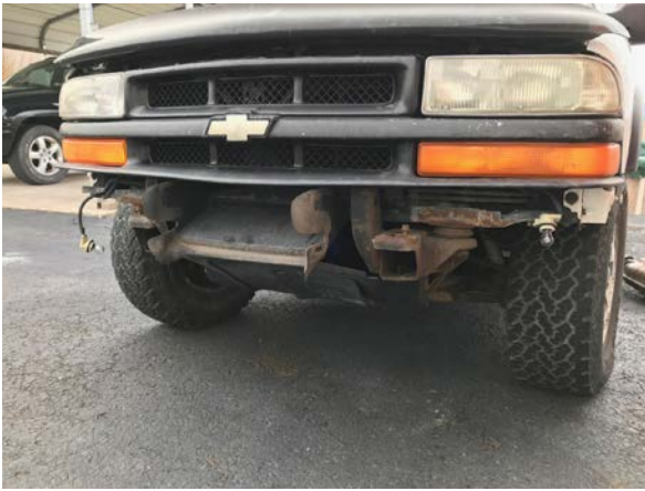
STEP 1 - REMOVE STOCK BUMPER AND PLASTIC AIR DUCT.